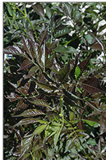
Guincho Purple Elder foliage

Guincho Purple Elder is recommended for the following landscape applications;