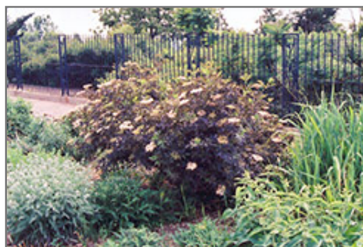
Guincho Purple Elder in bloom