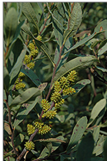
Sweet Gale flowers

Sweet Gale is recommended for the following landscape applications;