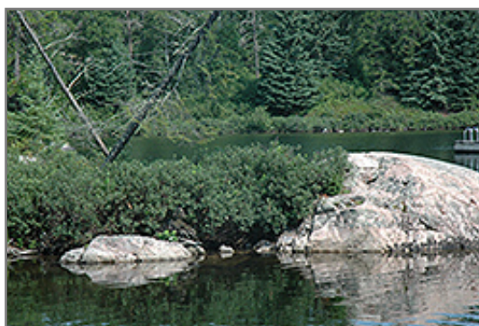
Sweet Gale