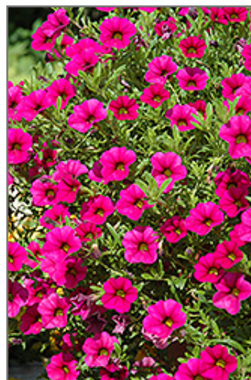
Cabaret Rose Calibrachoa flowers