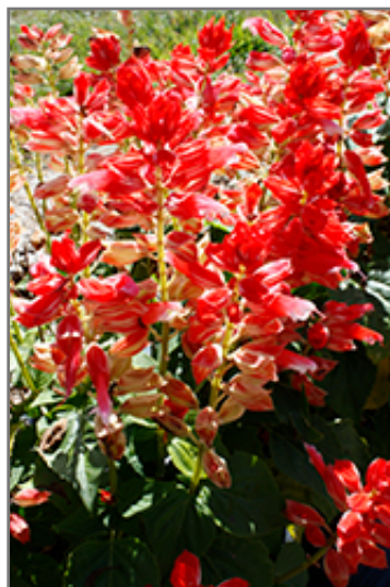
Vista Red And White Salvia flowers