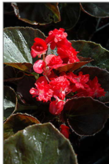
Doublet Red Begonia flowers

Doublet Red Begonia is recommended for the following landscape applications;