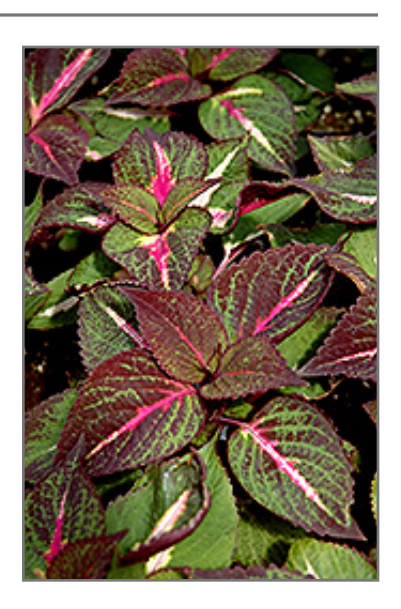
Magilla Perilla foliage

Magilla Perilla will grow to be about 3 feet tall at maturity, with a spread of 18 inches. When grown in masses or used as a bedding plant, individual plants should be spaced approximately 16 inches apart. Although it's not a true annual, this fast-growing plant can be expected to behave as an annual in our climate if left outdoors over the winter, usually needing replacement the following year. As such, gardeners should take into consideration that it will perform differently than it would in its native habitat.