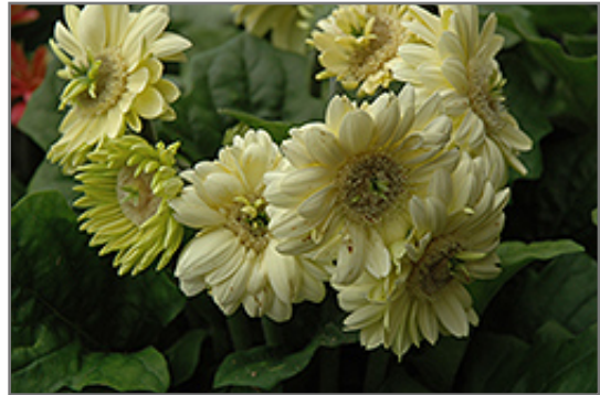
Cream Gerbera Daisy flowers