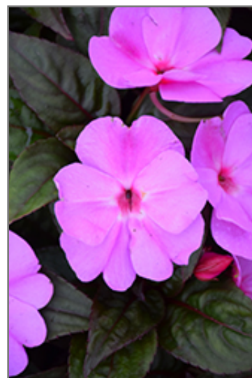
Divine Lavender New Guinea Impatiens flowers

Divine Lavender New Guinea Impatiens is recommended for the following landscape applications;