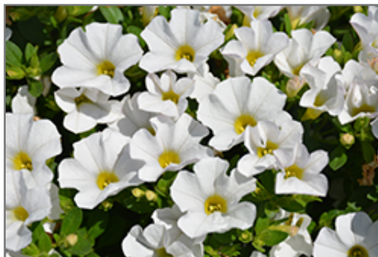
Cabaret White Calibrachoa flowers

Cabaret White Calibrachoa is recommended for the following landscape applications;