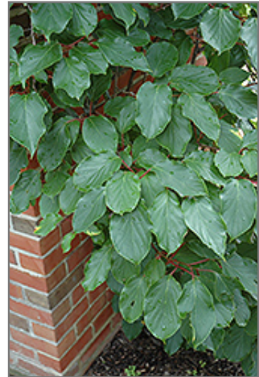
Weiki Hardy Kiwi foliage

Weiki Hardy Kiwi will grow to be about 40 feet tall at maturity, with a spread of 24 inches. As a climbing vine, it tends to be leggy near the base and should be underplanted with low-growing facer plants. It should be planted near a fence, trellis or other landscape structure where it can be trained to grow upwards on it, or allowed to trail off a retaining wall or slope. It grows at a fast rate, and under ideal conditions can be expected to live for approximately 15 years.