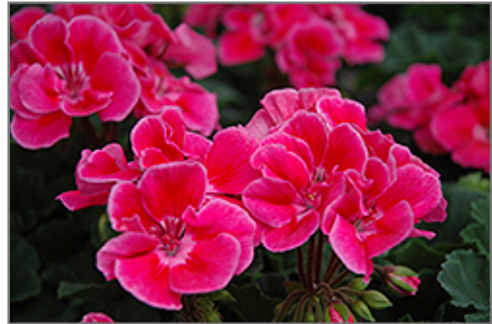
Presto Rose Sizzle Geranium flowers