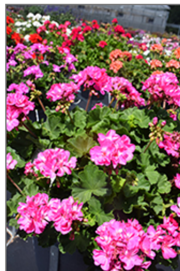
Fantasia Shocking Pink Geranium in bloom