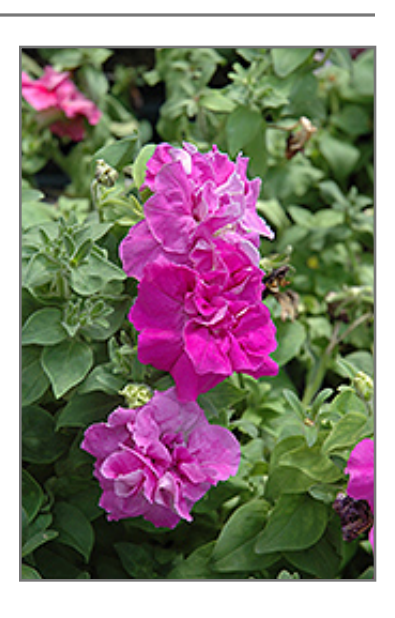
Double Madness Lavender Petunia flowers

Double Madness Lavender Petunia will grow to be about 12 inches tall at maturity, with a spread of 12 inches. When grown in masses or used as a bedding plant, individual plants should be spaced approximately 10 inches apart. Its foliage tends to remain dense right to the ground, not requiring facer plants in front. This fast-growing annual will normally live for one full growing season, needing replacement the following year.