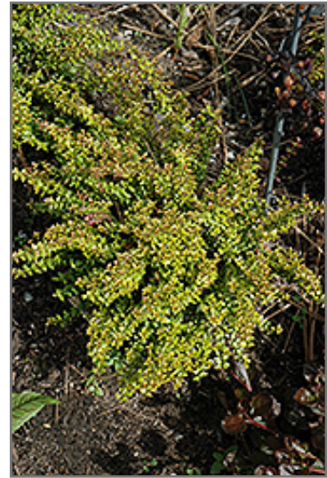
Twiggy Box Honeysuckle

Twiggy Box Honeysuckle is recommended for the following landscape applications;