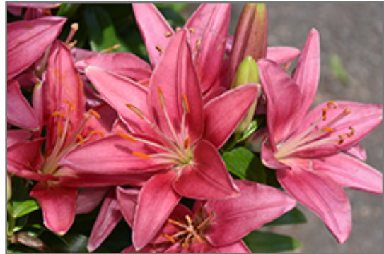
Lily Looks Tiny Pearl Lily flowers