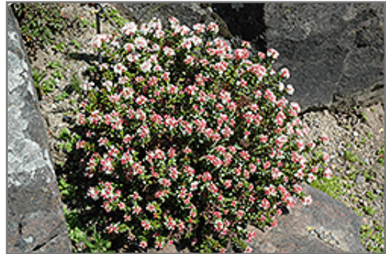
Sand Myrtle in bloom