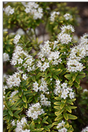
Sand Myrtle flowers

This plant is not reliably hardy in our region, and certain restrictions may apply; contact the store for more information.