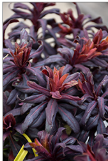
Ruby Glow Wood Spurge flowers

Ruby Glow Wood Spurge is recommended for the following landscape applications;