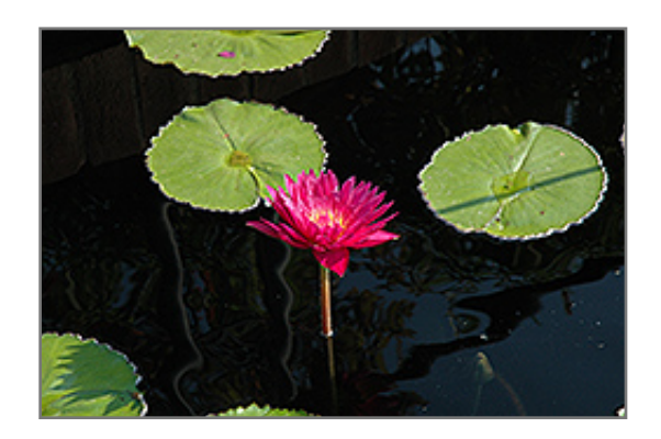
Bull's Eye Tropical Water Lily flowers

This plant will require occasional maintenance and upkeep, and should be cut back in late fall in preparation for winter. It has no significant negative characteristics.