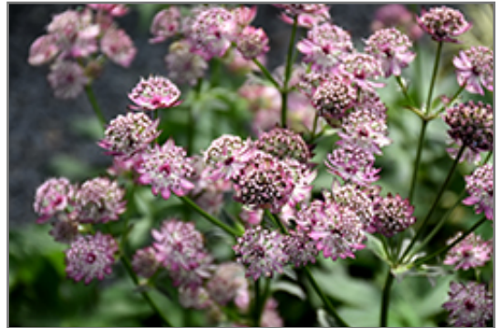
Abbey Road Masterwort flowers