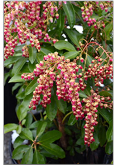
Valley Valentine Japanese Pieris flowers