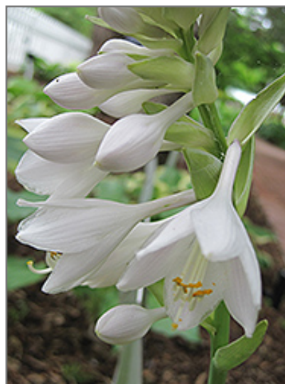
Rosedale Golden Goose Hosta flowers