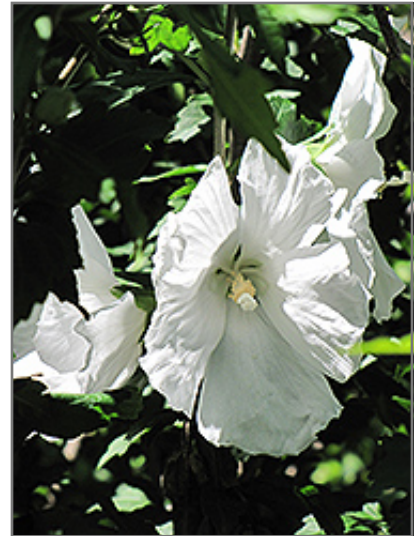
William R. Smith Rose of Sharon flowers