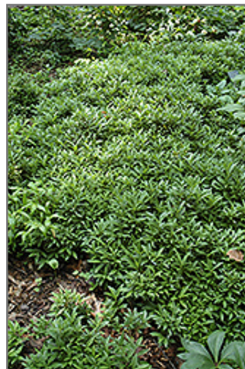
Dwarf Sweet Box