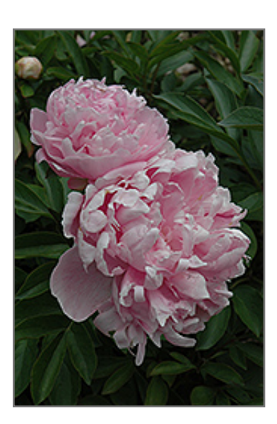
Mrs. Livingston Ferrand Peony flowers

Mrs. Livingston Ferrand Peony will grow to be about 30 inches tall at maturity, with a spread of 3 feet. When grown in masses or used as a bedding plant, individual plants should be spaced approximately 30 inches apart. The flower stalks can be weak and so it may require staking in exposed sites or excessively rich soils. It grows at a slow rate, and under ideal conditions can be expected to live for approximately 20 years. As an herbaceous perennial, this plant will usually die back to the crown each winter, and will regrow from the base each spring. Be careful not to disturb the crown in late winter when it may not be readily seen!