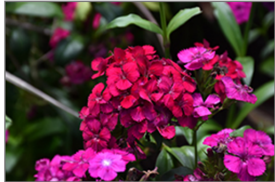
Amazon Neon Cherry Pinks flowers