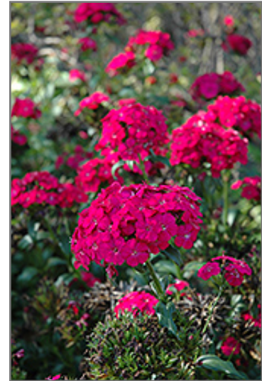
Amazon Neon Cherry Pinks flowers

Amazon Neon Cherry Pinks is an herbaceous evergreen perennial with a mounded form. It brings an extremely fine and delicate texture to the garden composition and should be used to full effect.