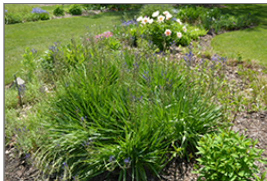
Blue Danube Camassia in bloom