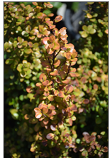
African Boxwood foliage