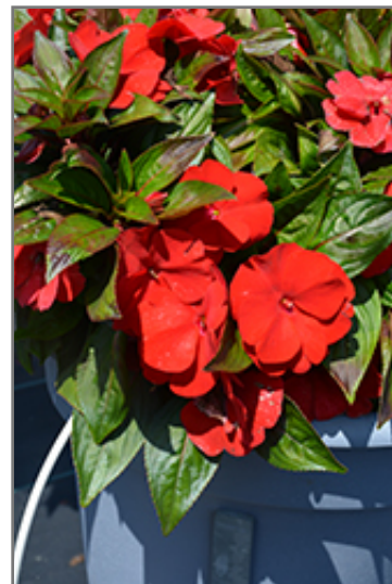
Petticoat Dark Red New Guinea Impatiens flowers

Petticoat Dark Red New Guinea Impatiens is recommended for the following landscape applications;