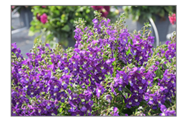
Serafina Blue Angelonia flowers

Serafina Blue Angelonia is recommended for the following landscape applications;