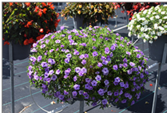
MiniFamous Neo Double Silver Blue Calibrachoa in bloom

MiniFamous Neo Double Silver Blue Calibrachoa is a fine choice for the garden, but it is also a good selection for planting in outdoor containers and hanging baskets. Because of its trailing habit of growth, it is ideally suited for use as a 'spiller' in the 'spiller-thriller-filler' container combination; plant it near the edges where it can spill gracefully over the pot. Note that when growing plants in outdoor containers and baskets, they may require more frequent waterings than they would in the yard or garden.