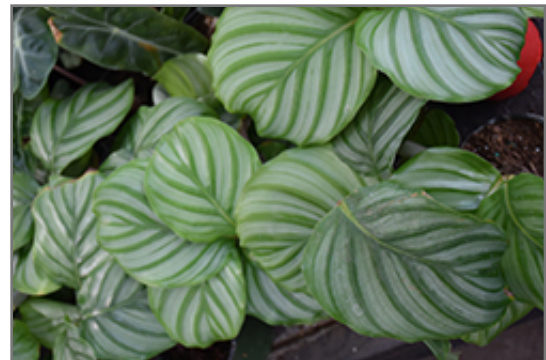
Color Full Orbifolia Prayer Plant foliage