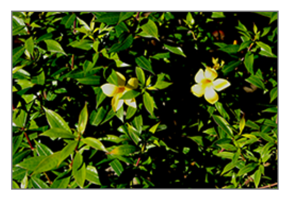
Compact Golden Trumpet flowers

Compact Golden Trumpet is a fine choice for the garden, but it is also a good selection for planting in outdoor pots and containers. It can be used either as 'filler' or as a 'thriller' in the 'spiller-thriller-filler' container combination, depending on the height and form of the other plants used in the container planting. It is even sizeable enough that it can be grown alone in a suitable container. Note that when growing plants in outdoor containers and baskets, they may require more frequent waterings than they would in the yard or garden.