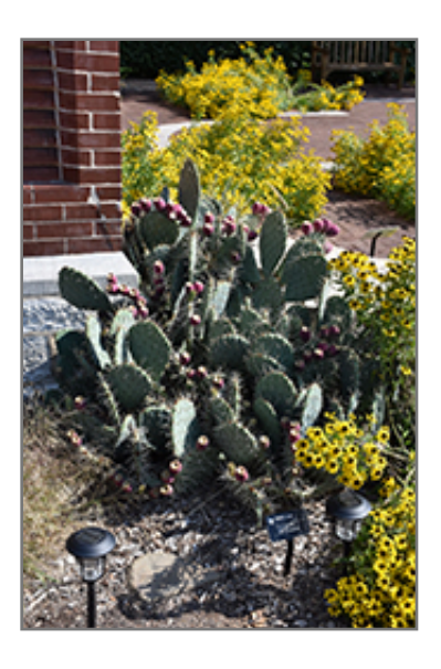
Coastal Prickly Pear Cactus