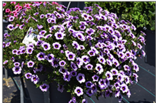
Cabrio Eclipse Lilac Calibrachoa in bloom