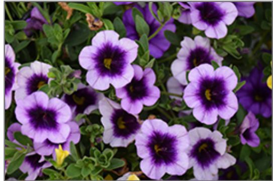
Cabrio Eclipse Lilac Calibrachoa flowers

Cabrio Eclipse Lilac Calibrachoa is recommended for the following landscape applications;