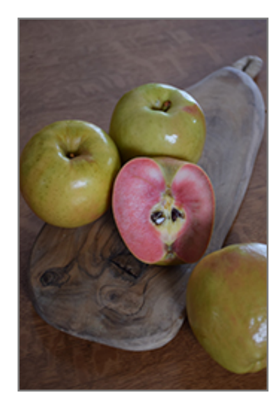
Airlie Red Flesh Apple fruit and flesh