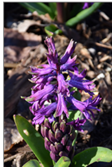
Purple Sensation Hyacinth flowers

Purple Sensation Hyacinth is recommended for the following landscape applications;