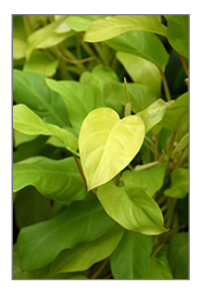
Lemon Lime Philodendron foliage

When grown indoors, Lemon Lime Philodendron can be expected to grow to be about 12 inches tall at maturity, with a spread of 6 feet. It grows at a fast rate, and under ideal conditions can be expected to live for approximately 10 years. This houseplant performs well in both bright or indirect sunlight and strong artificial light, and can therefore be situated in almost any well-lit room or location. It does best in average to evenly moist soil, but will not tolerate standing water. The surface of the soil shouldn't be allowed to dry out completely, and so you should expect to water this plant once and possibly even twice each week. Be aware that your particular watering schedule may vary depending on its location in the room, the pot size, plant size and other conditions; if in doubt, ask one of our experts in the store for advice. It is not particular as to soil type or pH; an average potting soil should work just fine. Be warned that parts of this plant are known to be toxic to humans and animals, so special care should be exercised if growing it around children and pets.