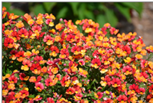
Babycakes Little Orange Nemesia flowers

Babycakes Little Orange Nemesia will grow to be about 8 inches tall at maturity, with a spread of 12 inches. When grown in masses or used as a bedding plant, individual plants should be spaced approximately 8 inches apart. Its foliage tends to remain low and dense right to the ground. This fast-growing annual will normally live for one full growing season, needing replacement the following year.