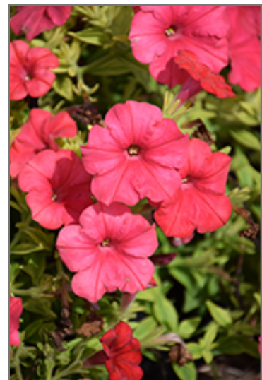
ColorRush Watermelon Red Petunia flowers