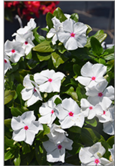
Cora XDR Polka Dot flowers

This plant will require occasional maintenance and upkeep, and should not require much pruning, except when necessary, such as to remove dieback. It is a good choice for attracting butterflies to your yard, but is not particularly attractive to deer who tend to leave it alone in favor of tastier treats. It has no significant negative characteristics.