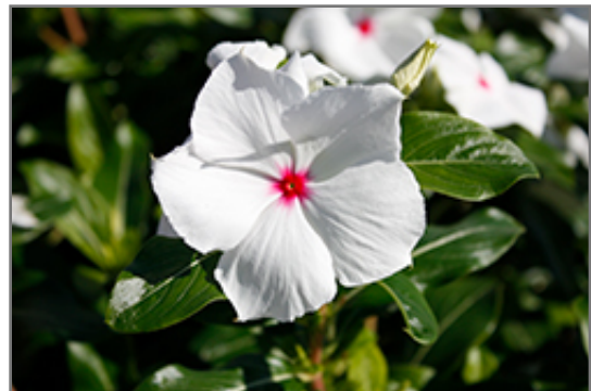
Cora XDR Polka Dot flowers