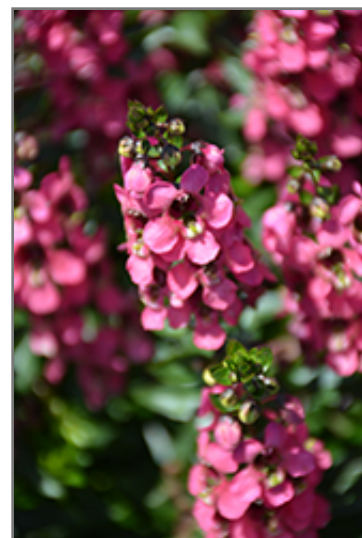
Serenita Rose Angelonia flowers

This plant will require occasional maintenance and upkeep, and should not require much pruning, except when necessary, such as to remove dieback. It is a good choice for attracting bees and butterflies to your yard, but is not particularly attractive to deer who tend to leave it alone in favor of tastier treats. It has no significant negative characteristics.