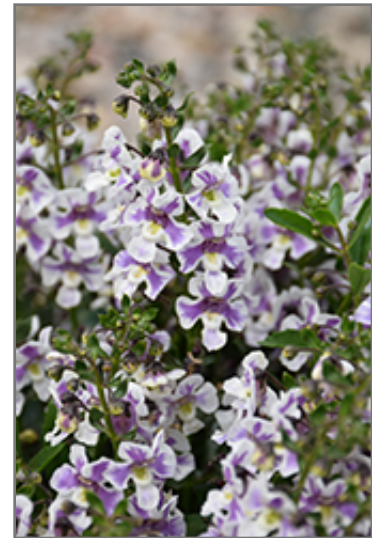
Alonia Bicolor Violet Angelonia flowers

Alonia Bicolor Violet Angelonia is recommended for the following landscape applications;