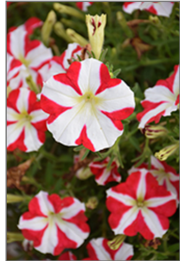
Amore King of Hearts Petunia flowers

This plant will require occasional maintenance and upkeep. Trim off the flower heads after they fade and die to encourage more blooms late into the season. It is a good choice for attracting butterflies and hummingbirds to your yard, but is not particularly attractive to deer who tend to leave it alone in favor of tastier treats. It has no significant negative characteristics.