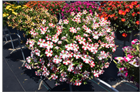
Amore King of Hearts Petunia in bloom

Amore King of Hearts Petunia is a fine choice for the garden, but it is also a good selection for planting in outdoor containers and hanging baskets. It is often used as a 'filler' in the 'spiller-thriller-filler' container combination, providing a mass of flowers against which the thriller plants stand out. Note that when growing plants in outdoor containers and baskets, they may require more frequent waterings than they would in the yard or garden.