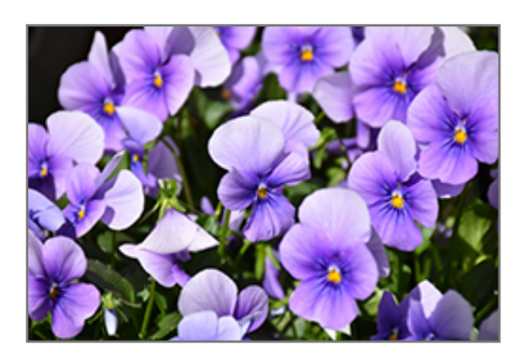
Sorbet Icy Blue Pansy flowers