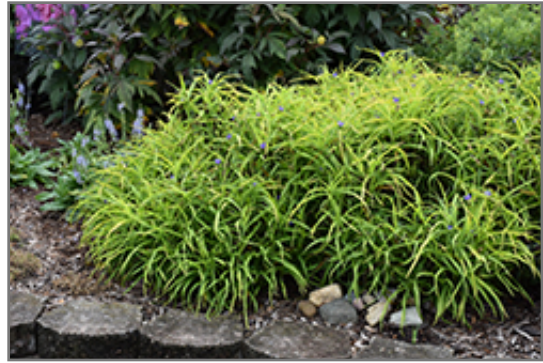
Charlotte's Web Spiderwort

This plant performs well in both full sun and full shade. It requires an evenly moist well-drained soil for optimal growth. It is not particular as to soil type or pH. It is highly tolerant of urban pollution and will even thrive in inner city environments. Consider applying a thick mulch around the root zone in winter to protect it in exposed locations or colder microclimates. This particular variety is an interspecific hybrid. It can be propagated by division; however, as a cultivated variety, be aware that it may be subject to certain restrictions or prohibitions on propagation.