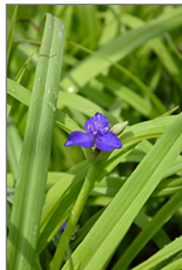
Charlotte's Web Spiderwort flowers

This is a relatively low maintenance plant, and is best cleaned up in early spring before it resumes active growth for the season. It is a good choice for attracting butterflies to your yard, but is not particularly attractive to deer who tend to leave it alone in favor of tastier treats. It has no significant negative characteristics.