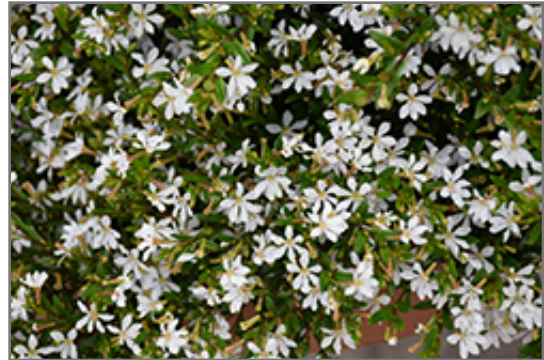
FloriGlory Maria Mexican Heather flowers

This is a multi-stemmed evergreen houseplant with an upright spreading habit of growth. Its relatively fine texture sets it apart from other indoor plants with less refined foliage. This plant may benefit from an occasional pruning to look its best.