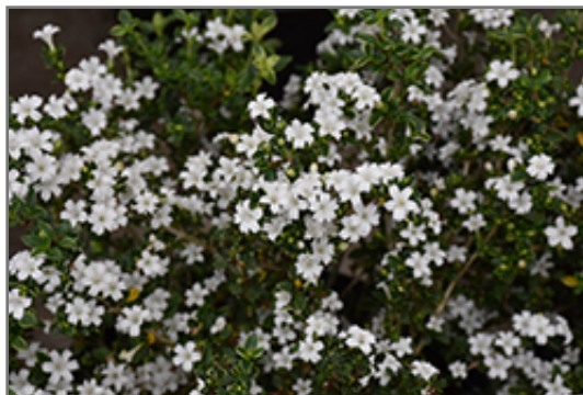
Variegated Serissa flowers

Variegated Serissa is recommended for the following landscape applications;