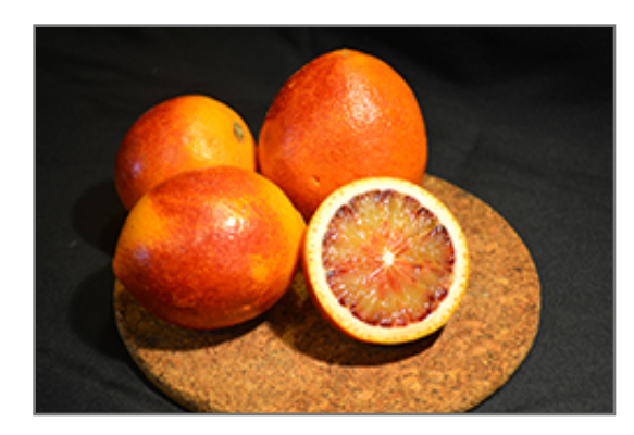
Sanguinelli Blood Orange fruit and flesh