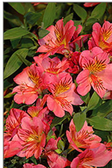
Colorita Eliane Alstroemeria flowers

Colorita Eliane Alstroemeria is recommended for the following landscape applications;