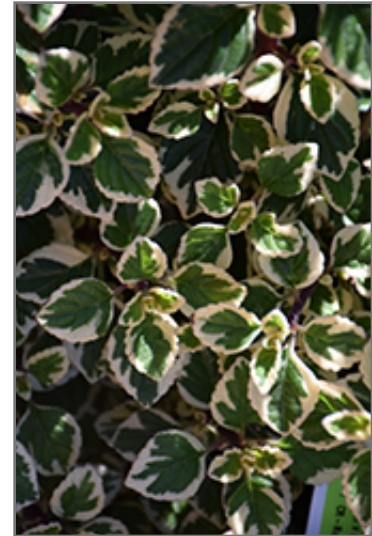
Candy Kisses Wild Sage foliage

This is a dense multi-stemmed evergreen houseplant with a more or less rounded form. Its relatively fine texture sets it apart from other indoor plants with less refined foliage. You may trim off the flower heads after they fade and die to encourage repeat blooming.